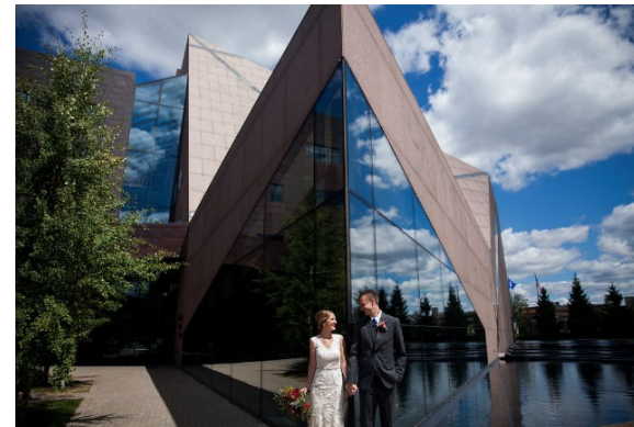
Amy Mae Photography