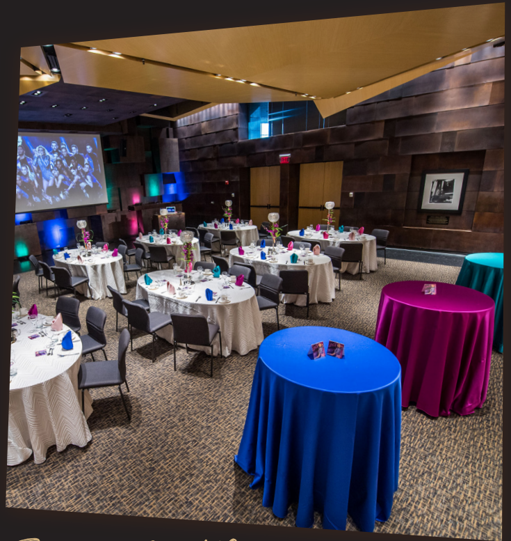
Johnson Great Room

As the largest private meeting room in McNamara, the Johnson Great Room easily accommodates meetings and conferences of up to 175 people and can accommodate two-way video and audio, multiple standard lighting choices, and unique architectural treatments.